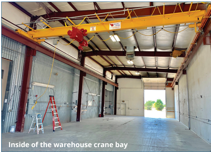
Inside of the warehouse crane bay