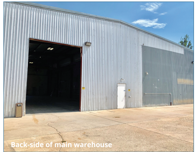
Back-side of main warehouse